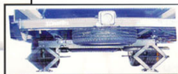
Rear jack system extended & retracted positions...