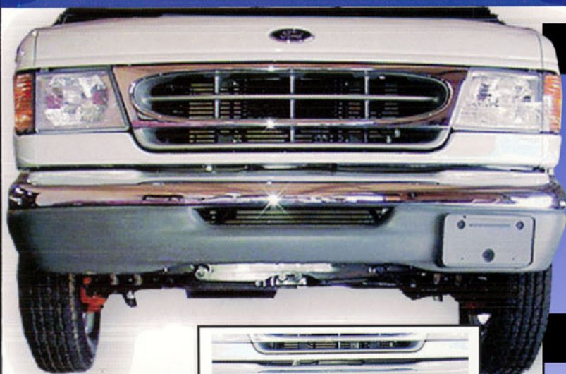
FRONT JACK SYSTEM EXTENDED AND RETRACTED POSITIONS