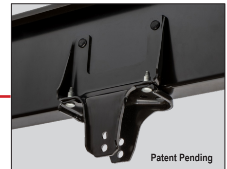
Fully Integrated into our NXG Hucked Frame