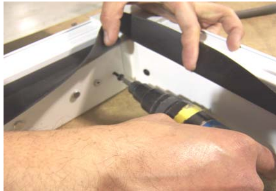
Step Four: Place a screw into the pre-punched hole in the jamb.