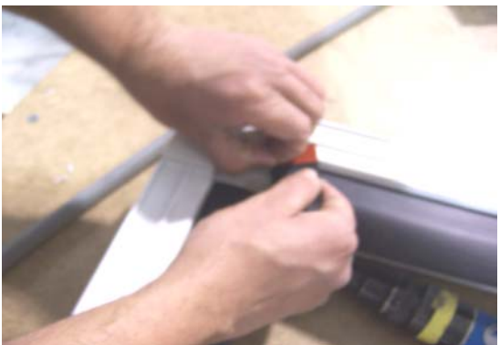
Step Five: Treat the area of wipe with alcohol and primer and remove the tape backer.